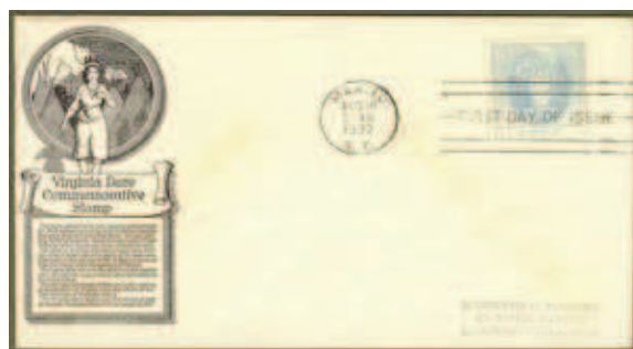
Postal - Envelope

You have learnt that messages can be written on the post card or on the inland letter card. But post cards are not suitable for sending confidential messages. Again in inland letter it is not possible to send any enclosure although it ensures secrecy of the message. Now, suppose you want to send your application or bio-data seeking employment in any organisation. Can you send it through mail? Yes, for sending