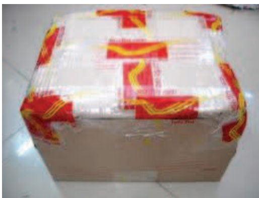
Picture of a Parcel Post

Suppose you want to send a book to your friend who is staying in the nearby town. Can you send it through post? Yes, it can be sent through the parcel service of Post office. Let us learn about it. The postal facility through which articles can be sent in the form of parcels is known as Parcel Post. It provides reliable and economical parcel delivery service. Under parcel post services, parcels of specified size and weight can be sent across the country as well as outside the country. Postal charges vary according to the weight of the parcel. Separate postage is to be paid for inland and foreign parcel post.