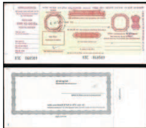
A Picture of Postal Order

Like Money Order, we can also send money through postal order i.e., Indian Postal Order (IPO). It is a convenient method of sending money from one place to another and is mainly used for remitting examination fees or while applying for any job. Postal Orders are available at all post offices in different denominations like Re.1/-, Rs.2/-, Rs.5/-, Rs.7/-, Rs.10/-, Rs.20/-, Rs.50/-, and Rs.100/-. We can buy Postal orders on payment of prescribed charges and send it to the payee after mentioning his name and specifying the name of the post office, where it is intended to be encased. The payee after receiving the postal order produces it for payment at the post office mentioned there in. To ensure payment to the right person, we can cross the postal order by putting two parallel diagonal lines on its top left hand side corner just like crossing a bank draft or a cheque. The effect of crossing a postal order is that the payment can be collected through the payee's account at the post office or bank. This method of remittance is mostly used for official purposes.