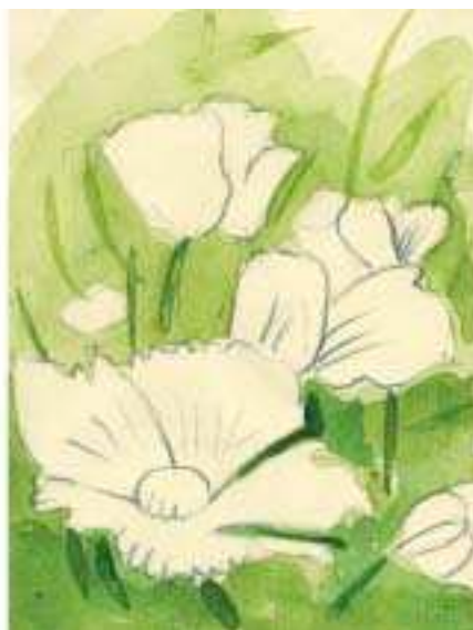
Fig. no. 7