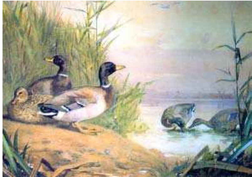
MALLARD AT THE WATER'S EDGE