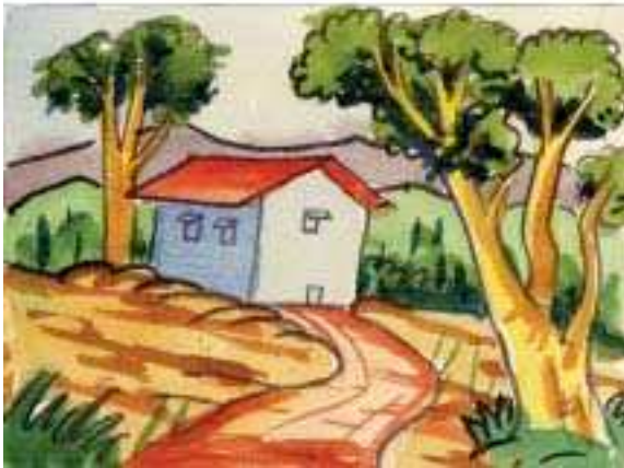
Fig. no. 8