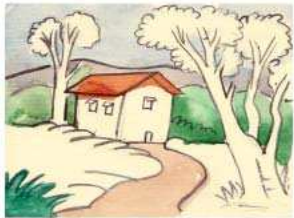
Fig. no. 8