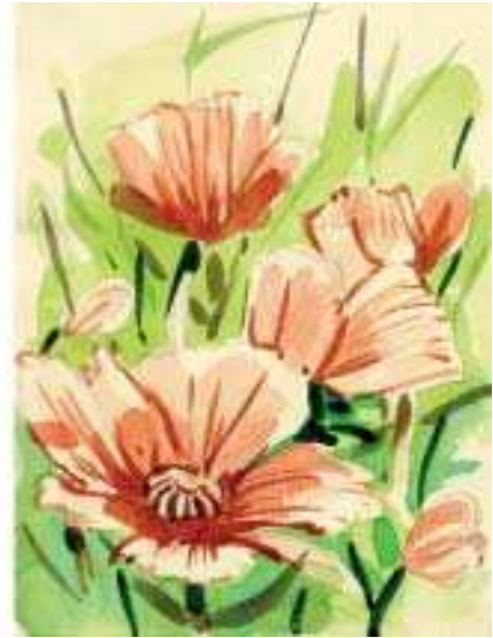
Fig. no. 7