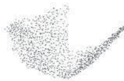
Fig No. 20

With stippling (Dots) you can bring different tones