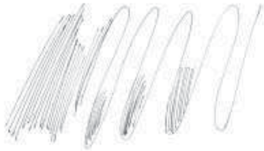
Fig No. 19

With stippling (Dots) you can bring different tones