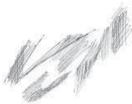
Fig No. 18