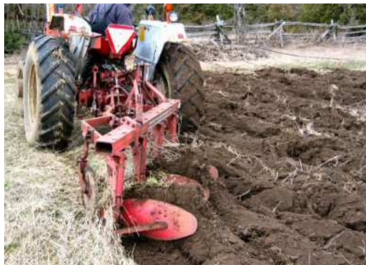
Fig. 31.2 Tractor for plantation