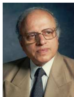
Dr. M. S. Swaminathan

A big change related to crop farming and food production occurred in the Indian agricultural scenario between 1968 and 1988. This period has been termed the golden age of agriculture named Green Revolution . As a result of the Green Revolution, we have become self-sufficient in the field of agriculture. The credit for this Green Revolution goes to Dr. M.S. Swaminathan a great agricultural scientist of our country for his fight against hunger. He has been awarded the World Food Prize. The joint efforts of our scientists and innumerable farmers had made such a change possible.