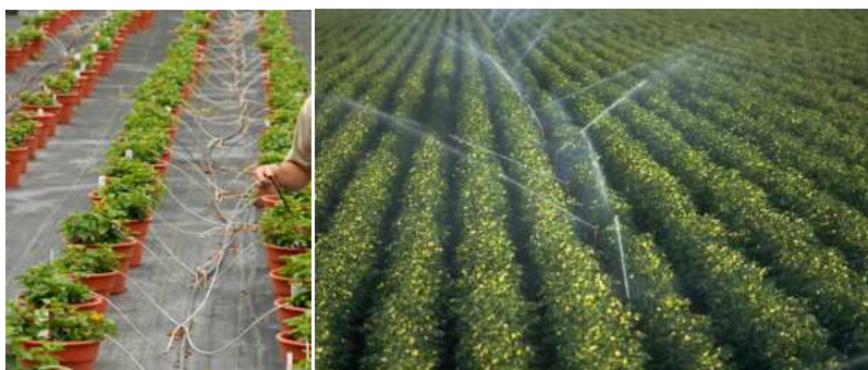
Fig. 31.3 (a) Drip irrigation (b) Sprinkling irrigation

Irrigation is necessary for the proper growth of crops. Irrigation depends upon the characteristics of the top soil and the type of crops. Crops need to be especially irrigated in their young stage, flower bearing stage and grain bearing stages. Rice requires continuous supply of water, now-a-days several methods of irrigation are available. Some of the modern irrigation methods include surface irrigation, underground irrigation, sprinkling irrigation and drip irrigation. (Fig. 31.3) A limited amount of water is used in all these types of irrigation. Thus wastage of water is prevented, in the drip irrigation method, water drips, drop by drop, by a special method as the top soil and mixes with it. In this way, it is available according to the need of the crop. These techniques have been successfully employed in deserts for growing crops.