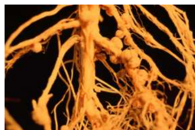
Fig. 31.1 Root nodules

They harbor nitrogen fixing bacteria in roots. These microbes convert the free nitrogen found in the atmosphere into usable form. Hence, after harvesting of these crops the soil remains fertile for other crops. (figure 31.1)