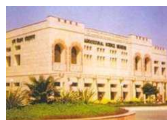
National Agriculture Science Museum, Delhi

If you get an opportunity to travel within Delhi, then definitely go to see the NASC (National Agriculture Science Council) Campus situated in the Todapur area. This trip can provide you with adequate information about the development of agriculture in the country. You can tabulate the relevant information in the table above.