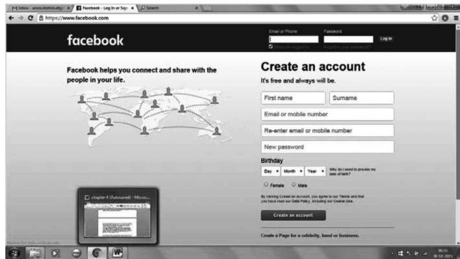
Fig. 6.3: Home Page of Facebook