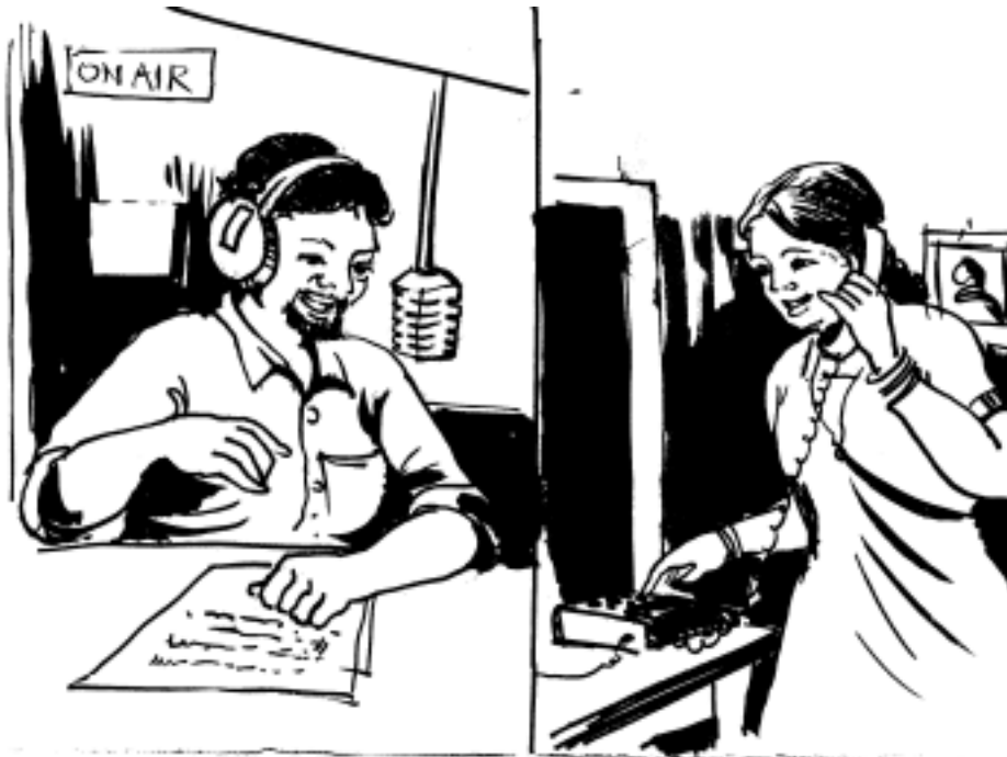
Fig. 11.1: Phone-in programme