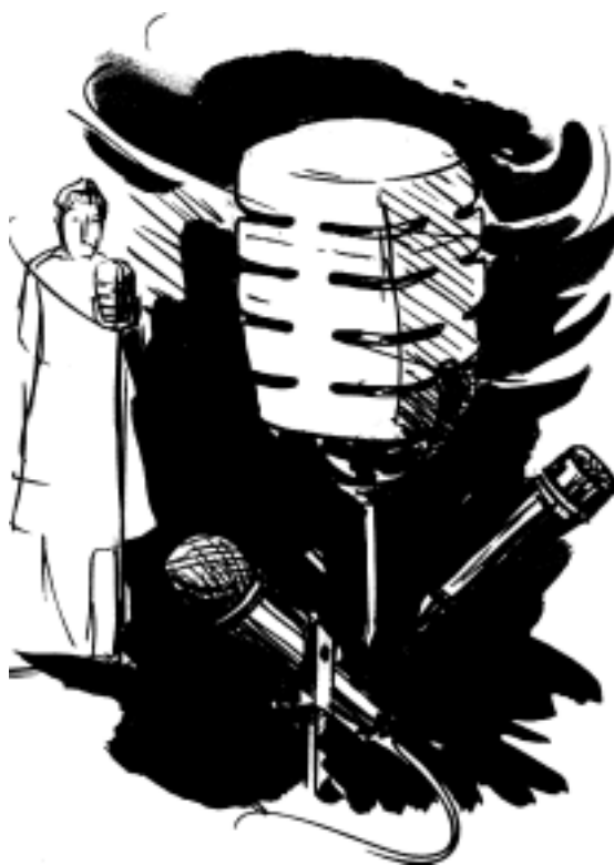
Fig. 12.1: Microphones

There are many other types of microphones which come in different sizes and lengths. If you watch television programmes, you may find a small microphone clipped on the collar. This is called a lapel microphone which is actually a uni-directional microphone. These microphones are not normally used in radio. Then there are long microphones called gun microphones used in sports production. These microphones are often omni directional ones. There are also cordless microphones . You might have seen them being used in stage shows. They do not have any cables or wires attached to them. They have a small transmitter in them which can send the sounds to an amplifier.