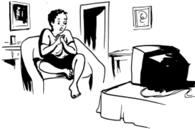
Fig. 13.4 : Expressing fear

Some television programmes can induce fear in children.