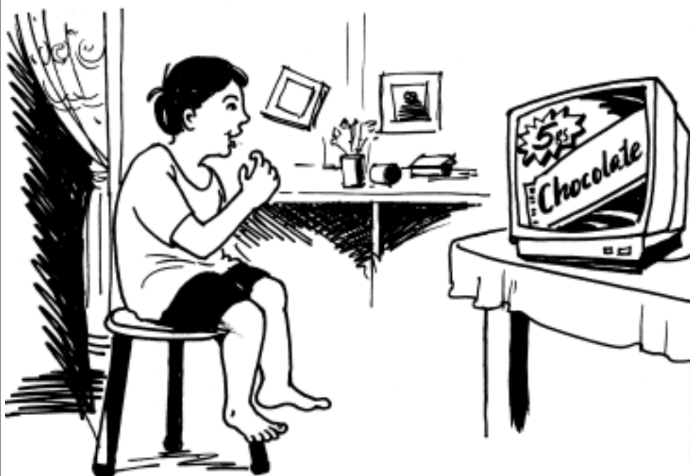
Fig. 13.1(a) : A child watching the ad of a particular brand of chocolate on TV

As a child, have you ever nagged your parents to get you the brand of chocolate advertised on TV? How did your parents react?