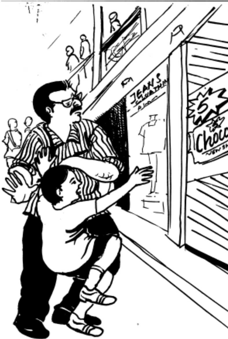
Fig. 13.1(b) : The same child creating a fuss in a shopping mall for the chocolate bar advertised and seen by him on TV.

Stereotype: an oversimplified standardized image of a person or group