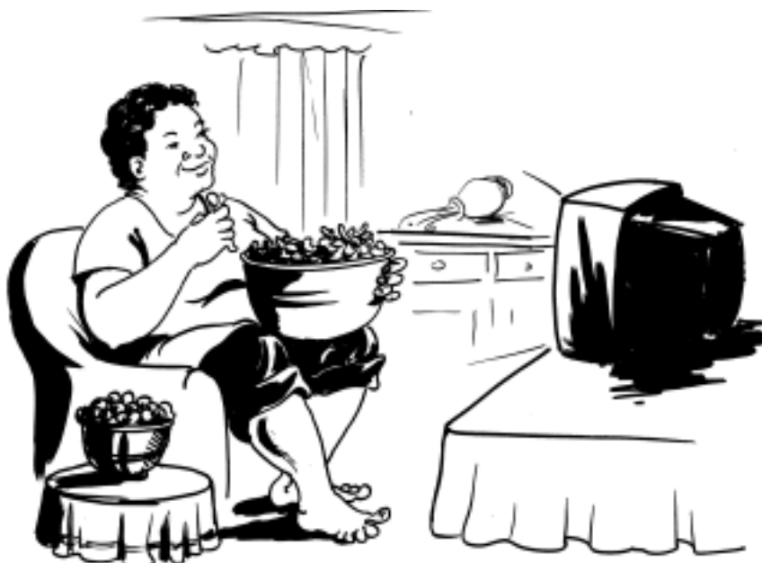
Fig. 13.2: Couch Potato

Television viewing has also been linked with the creation of stereotypes. Watch some of the women based serials and observe where maximum time is spent by the heroine. You are most likely to find her spending most of the time inside a house. Here the stereotype that women are supposed to spend most of the time at home is subtly re-enforced. You would have come across the portrayal of a “madrasi” in Hindi comedy shows. This depiction may not have any real relation to a South Indian.