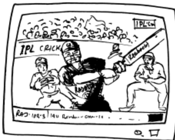
Fig. 15.3: Sports channels

Have you ever seen a live cricket match on television? Or for that matter a football tournament? Apart from news channels, another important category of television channels are sports channels.