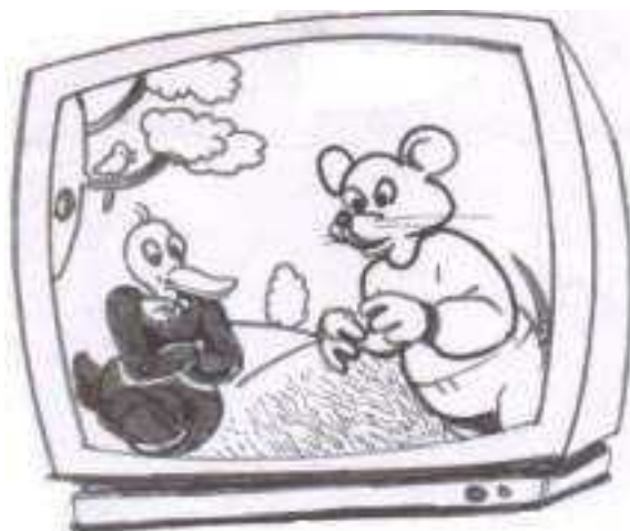
Fig. 15.4: Cartoon channel

Cartoon Network has also aired a few Indian-made cartoons, featuring ' Akbar and Birbal ', ' Tenali Raman ', ' Sindbad ', ' Ramayan ', ' Mahabharata ' and ' Vikram and Betal '.