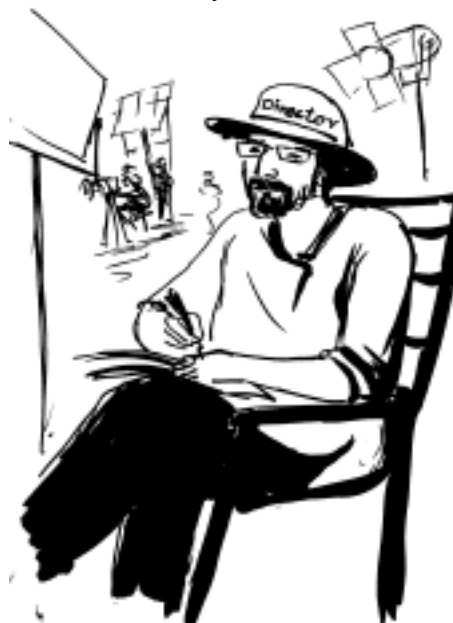
Fig. 16.7: Director

Who is a Director? In a television production, the Director is in-charge of directing the actors and technical operations. The Director is ultimately responsible for transforming a script into effective audio and video messages. Where the camera will be placed, what type of visuals need to be taken, where the actors will stand, all these are controlled by the director.