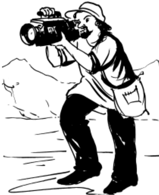
Fig. 16.9 (b) : Cameraperson

A Sound recordist records the complete sound track (dialogue and sound