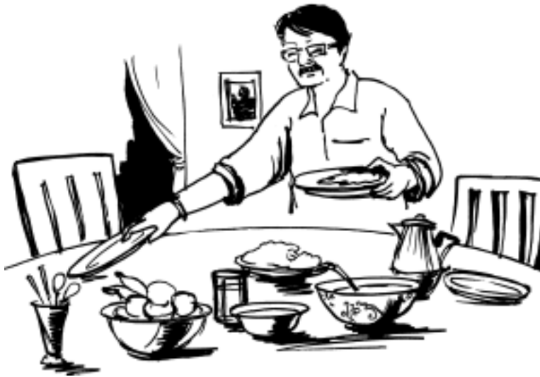
Fig. 16.1 (c)

Now imagine you have to produce a television programme. In a similar manner as above, you will first arrange everything required for the programme production. In the second stage you will actually carry on the production process, and thirdly you will polish the product for the final presentation on television. Thus, we can divide the entire production process into three major stages.