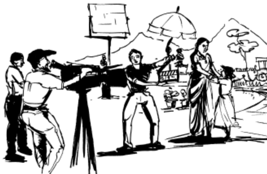
Fig. 16.10 : (b) Outdoor recording