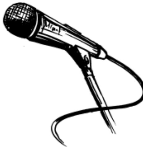
Fig. 16.6: Microphone

There are different types of microphones available for different purposes. Picking up a news anchor's voice, capturing the sounds of a tennis match, and recording a rock concert - all these require different types of microphones or a set of microphones.