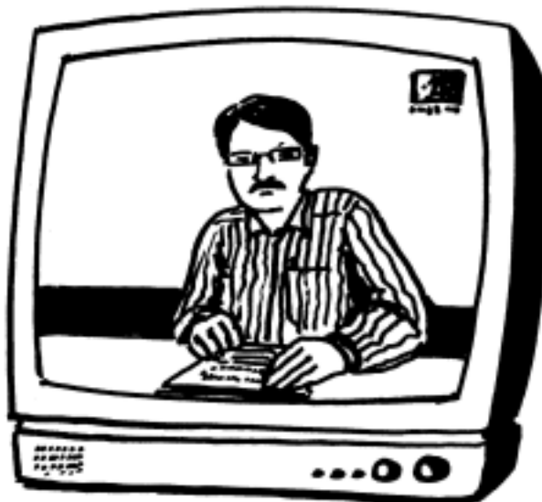
Fig. 16.8: Anchor

Who is your favourite anchor? Which programme does he/ she anchor?