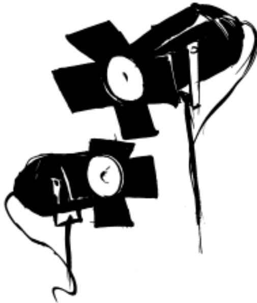
Fig. 16.5: Lights