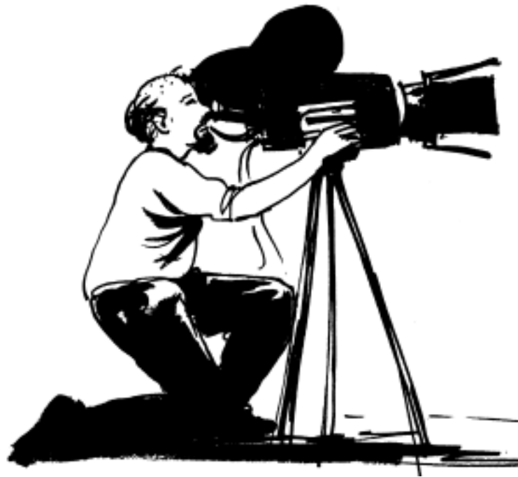
Fig. 16.9 (a) : Cameraperson