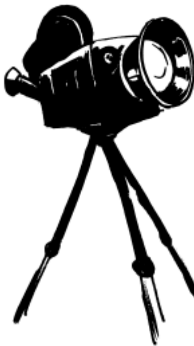
Fig. 16.4: Camera

If you carefully look at any camera, you will see a lens in it. This lens selects a part of the visible environment and produces a small optical image. The camera is principally designed to convert the optical image, as projected by the lens, into an electrical signal, often called the video signal.