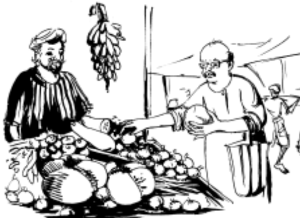
Fig. 16.1 (a)

So you have seen that there were three stages in the making of various food items. In stage one, you arranged for everything required for preparing the food items. In stage two, you actually prepared the food items and in the third stage, you presented them on the dining table.