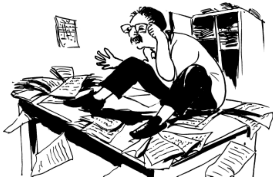
Fig. 16.3: Pre-production stage – getting ideas clear

In all it involves planning everything in advance. This is very essential to get desired results. If you have all the raw ingredients ready in your kitchen, you can easily cook the food. Similarly, if you have worked well in this stage of programme production, the other two stages become easy and workable.