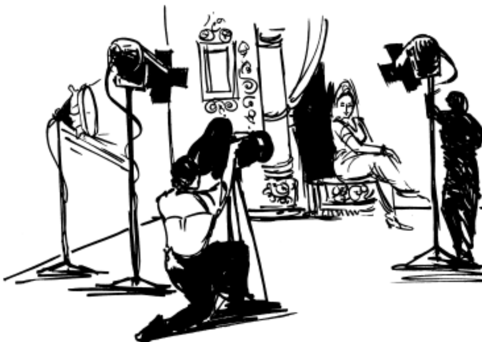
Fig. 16.10 : (a) Studio recording