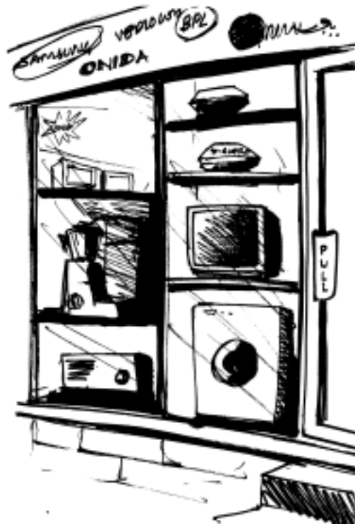
Fig. 19.4: Window display

You will learn about some of these methods in the next lesson.