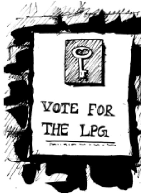
Fig. 19.6: Election poster

Several schemes are announced for the benefit of the public such as the sale of essential commodities like rice and wheat at affordable prices through the public distribution system, educational concessions for children etc.