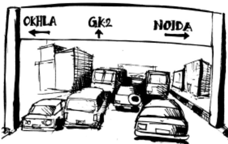
Fig. 19.1: Sign boards

The sign boards that you find on the roads is a simple example of public relations.