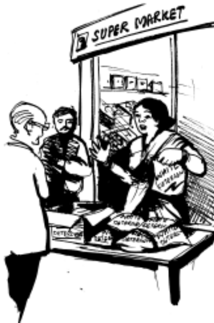
Fig. 19.3: Product demonstration

This is often done by giving samples of the product for use by consumers or by offering a discount on the product. Have you ever been offered samples of products by salespersons?