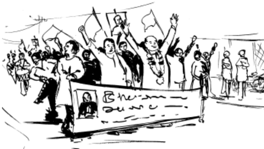
Fig. 19.5: Political rally

In order to gain the confidence of the people and persuade them for their votes, campaigns and meetings are organized.