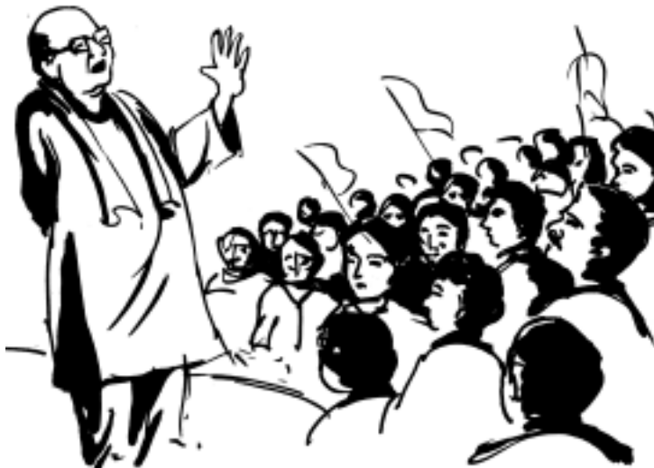
Fig. 20.1: Speech

This is an example of a speech which is a primary form of oral communication. A good speech helps in effectively communicating to the public. If the speech is delivered before a live audience, it provides an environment for a two-way communication.