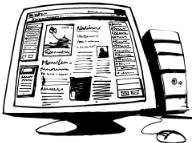
Fig. 20.4: Advertising through websites

The internet web is the most commonly used form of media for public relations.