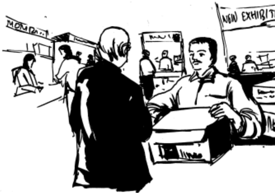
Fig. 20.5: Exhibition

Have you ever visited an exhibition? Then you would have seen several products being displayed and sold in a large space in an open area or in huge halls. You may have even bought a few items. You would also have come to know about several new products available in the market.