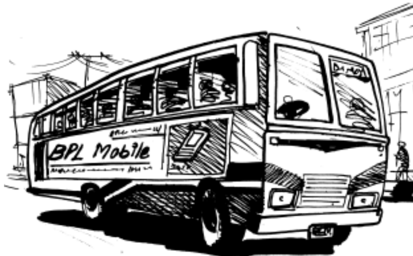
Fig. 20.4: Advertising on bus panels

However, you find that some forms of outdoor media such as hoardings erected on the roadside provide very little viewing time for the viewer and thus do not help in effective communication.