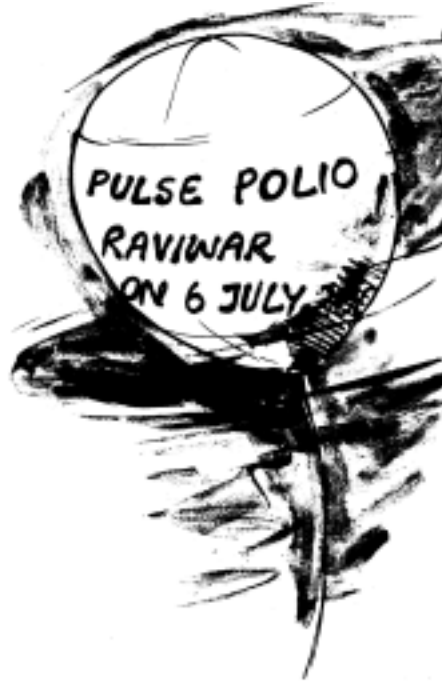
Fig. 20.3: Hot air balloon

However, you find that some forms of outdoor media such as hoardings erected on the roadside provide very little viewing time for the viewer and thus do not help in effective communication.