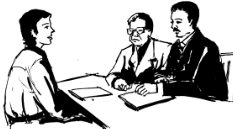
Fig. 20.2: Interview

the other answering them. The former is called an interviewer and the latter the interviewee. In this method, the interviewee gets an opportunity to impress the audience, fulfilling one of the goals of public relations.