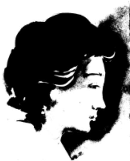
Fig. 25.5 (b) Printed positive image