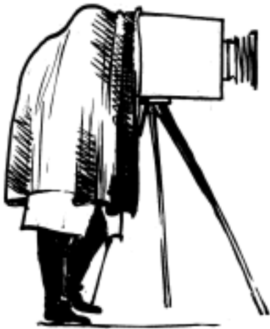
Fig 25.2 : (a) Old camera on stand

It must be mentioned here that for the first fifty years photography was nowhere as easy as we think of it today. The cameras were huge and had to be kept on a stand to be operated. Your great grandparents would have had to go to a studio where they would have had to sit still in front of the camera to have a photograph made. It was much later in the 1900s that easy to use light cameras were made which could be carried anywhere with ease and used without the support of a stand.