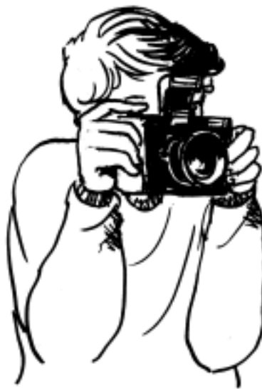
Fig 25.2 : (b) new camera