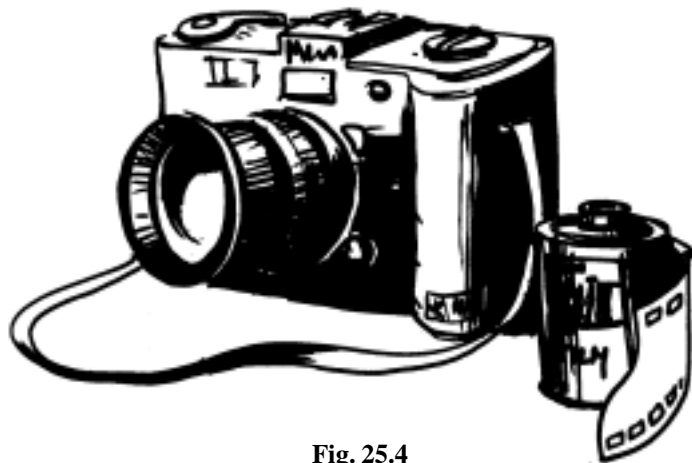
(b) Modern film roll