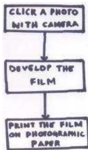
Fig 25.3: photoclick to final print

As you have learnt earlier, photography has two important components; one is the camera and the other is the film. A film is sensitive to light, so when we expose it to a scene with the click of the button, the impression of light is left on the film. This film is then processed in the laboratory and we see the picture that we have taken.