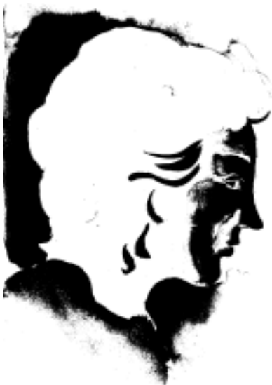
Fig. 25.5 (a) Negative image