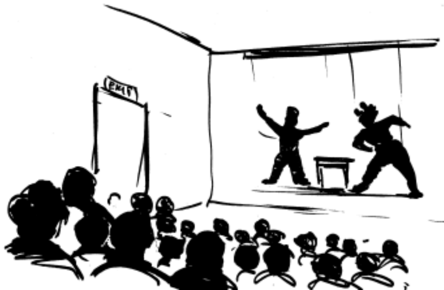
Fig.27.1: Watching a puppet show on a film screen

Traditional media continue to play an important role in our society. Ingredients of traditional media are given special projection in the mass media and as such traditional media are being used in development communication. You may recall what you have studied about development communication in the first module.