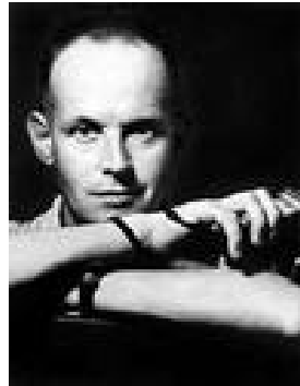
Fig. 28.4 (a) : Henri Cartier Bresson

There are several international photojournalists who loved photographing in India. Amongst them, the name of Henri Cartier Bresson is famous. Henri Cartier Bresson was French and his name is counted amongst the best photojournalists of the world. He travelled in India in the 1940s and then kept coming back here in later years. His most famous photograph is that of Pandit Jawaharlal Nehru announcing the death of Gandhiji. His book called 'Henri Cartier Bresson in India' is very well known.