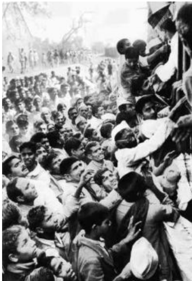
Fig. 28.4 (b) : Photograph taken by Henri Cartier Bresson