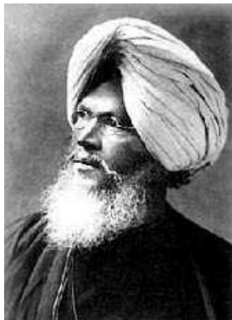
Fig. 28.1: Raja Deen Dayal

Raja Deen Dayal was one of the first notable Indian photojournalists. He was a court photographer in India during the rule of the sixth Nizam of Hyderabad. As he was the only native photographer, he has left behind a very impressive record of British India.