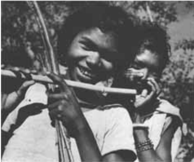
Fig. 28.2

Among the famous photojournalists who worked then was Sunil Janah . A political activist and journalist, Sunil Janah began to photograph while writing assignments for his newspaper. At the time of India's independence, Janah photographed the significant events in the country and made a record of the transition from British rule to independent India. His photographs of India's partition, its people; specially the tribals as well as pictures of industries and temple structures are very famous. Photographs of Nehru and Gandhi by Sunil Janah are now seen by us everywhere.