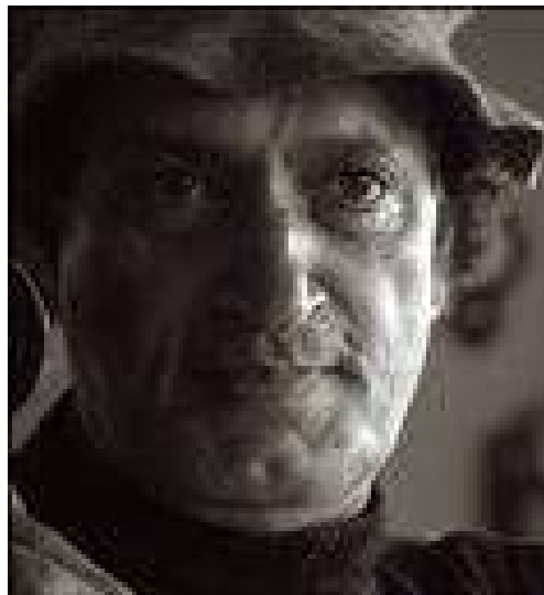
Fig. 28.5 : Raghu Rai

Amongst the photojournalists after Independence, the name of Raghu Rai is most famous. Rai's photographs are still seen as he continues to do photography. Raghu Rai started his career in photojournalism in the 1960s in Delhi and worked for important national newspapers like the Hindustan Times and Statesman. Later he became the Chief Photographer for 'India Today' where he worked for a long time. Now Mr Rai works as an independent photographer and his work is truly respected all over the world. His photographs of famous personalities such as Indira Gandhi and Mother Teresa are very well known. Apart from this Raghu Rai has covered all important events that have taken place in the second half of the last century such as the Bhopal gas tragedy and the Bangladesh war. He has brought out books on various subjects such as Delhi, Taj Mahal, Sikhs, Benaras etc. His early pictures are mostly in black and white but later he has photographed in colour. They all have a beautiful quality about them.