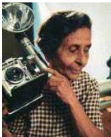
Fig. 28.3 : Homai Vyrawalla

There is another name which needs a special mention here, also because in a profession dominated by men, she was the first woman photojournalist. She is Homai Vyrawalla . Her work was first published in 1938 in the Bombay Chronicle, and later in other major publications of those times. She also worked for the Illustrated Weekly of India and during World War II covered every aspect of wartime activities in India. Her documentation of the events of the freedom movement are significant. She remained a freelance photographer until 1970 and was highly respected amongst all photojournalists.