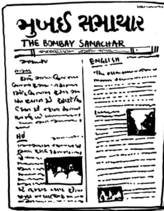
Fig 5.8: Mumbai Samachar

The Gujarati daily "Mumbai Samachar" published from Mumbai is the oldest existing newspaper not only in India but also in Asia. It was established in 1822.