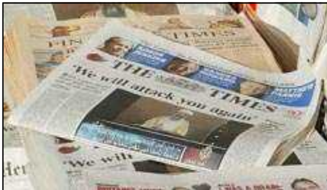
Fig 5.13: Broadsheet

Morning newspapers are generally broadsheets. They are big in size. In India, all major newspapers are broadsheets. Examples include “The Times of India” and “Hindustan Times”. Tabloids are only half the size of broadsheets. In India most of the evening papers are tabloids. Examples are “Mid-day” and “Metro Now”. Presently some of the new morning papers have also adopted the tabloid format.