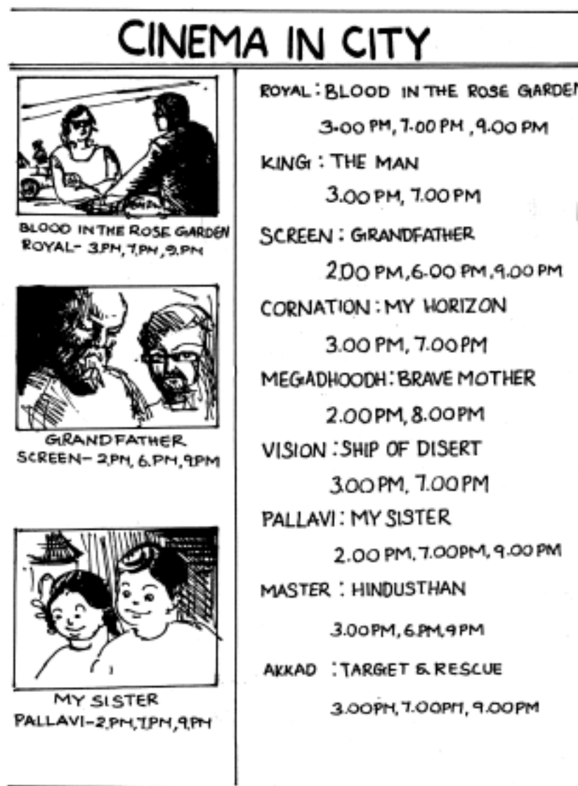
Fig 5.2: Cinema theatre list

You must have seen such columns in the newspaper. They appear under the title 'entertainment'. So you look into the newspaper for entertainment also.