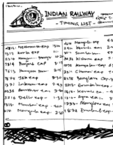
Fig 5.3: Railway timings list

You must have seen such columns in newspapers. They give you such information. So you are reading the paper for information also.