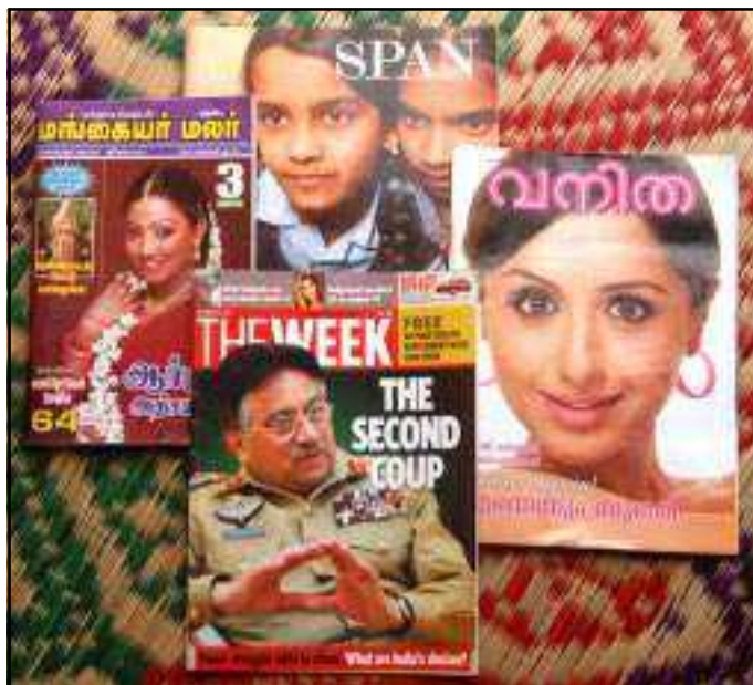
Fig 5.15: Magazines

“India Today” is a weekly, while “Chompak” is a fortnightly. “Grihasobha” and “Vanitha” are monthlies.