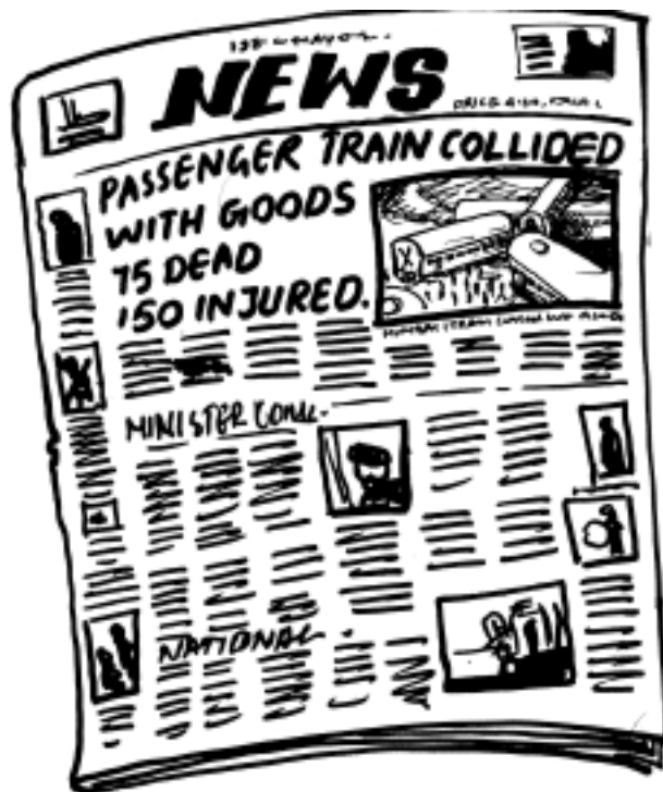
Fig 5.1: News of a rail accident

Ramu and Ravi were planning to go for a movie. Both got pocket money from their parents and permission to go for a film. Ramu asked Ravi whether he knows the names of films playing in different theatres in the City. Ravi was also not sure about it. So they picked up a newspaper. The paper gave all the details about films shown in different cinema halls in the city.