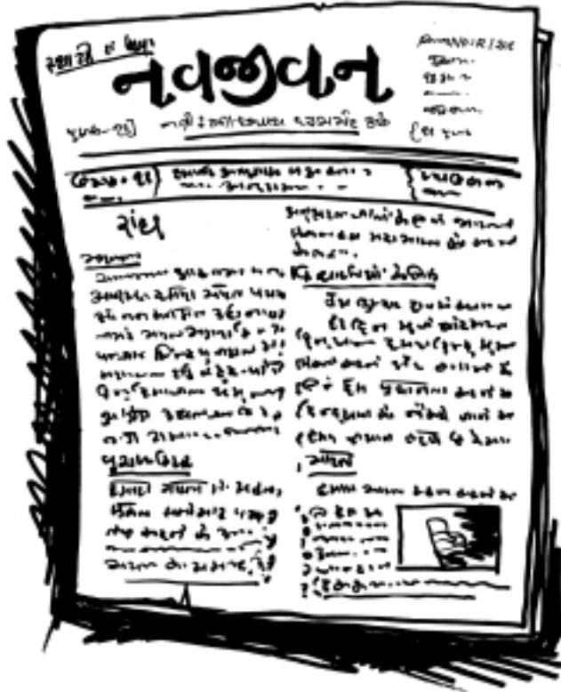
Fig 5.11: Navjeevan

Can you guess how many newspapers in India have crossed 100 years of publication and are still in circulation? There are 41 such newspapers in the country and are called centenarian newspapers. Among English dailies, four have crossed this mark: The Times of India, The Hindu, The Tribune and The Statesman. Among language newspapers, Mumbai Samachar, Amrita Bazar Patrika, Malayala Manorama and Deepika are among the centenarians.