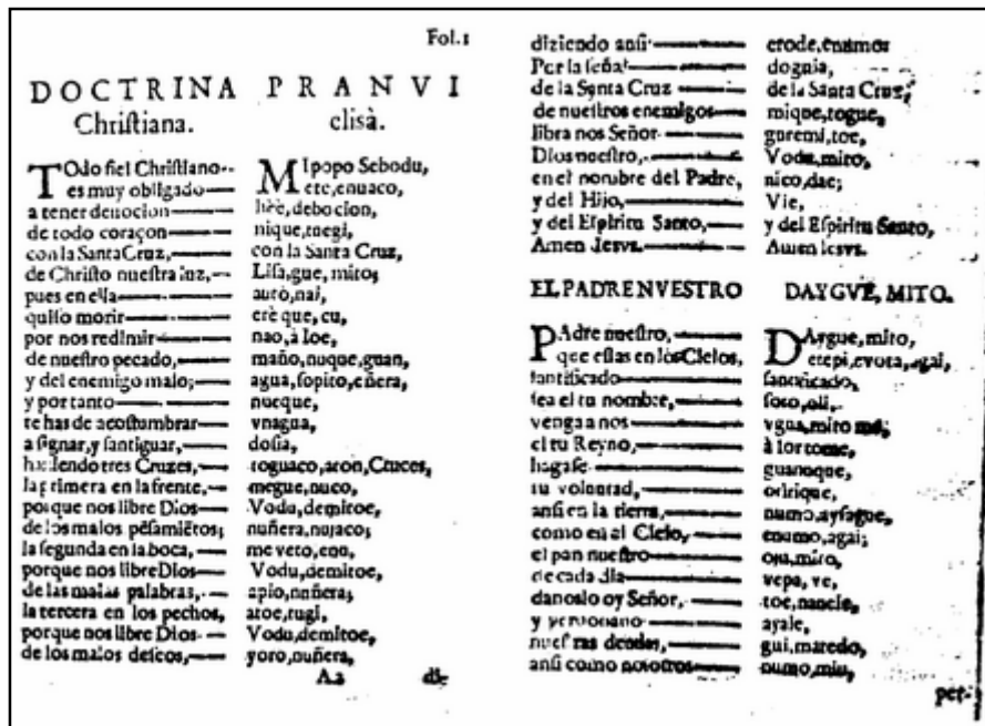
Fig 5.6: Doctrina Christa

The invention of printing has revolutionised mass communication. Books are printed in large numbers and circulated in many countries. No other invention has had such an influence in the history of mankind.